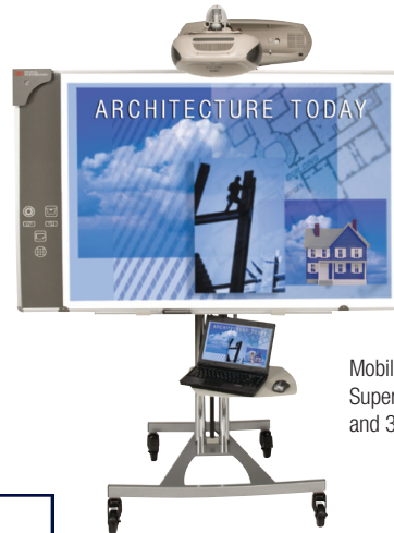
Mobile Stand shown with 3M™ Super Close Projection SCP712 and 3M™ Digital Board